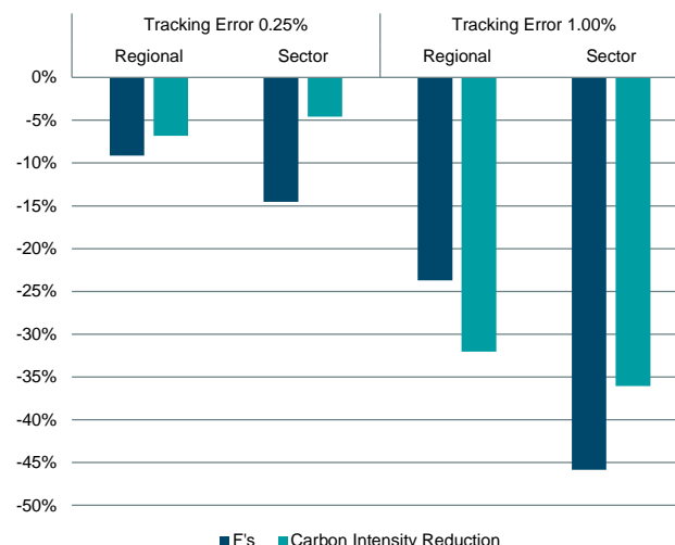
FIGURE 4. RELATIVE ESG-IMPROVEMENTS FOR REGIONAL AND SECTOR OPTIMIZATION FOR TRACKING ERRORS 0.25% AND 1.00% SCENARIO 1

Data as of 30 September 2020