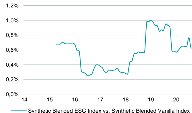
FIGURE 6. ROLLING 12M TRACKING ERROR OF ESG ASSET ALLOCATION VERSUS TRADITIONAL ASSET ALLOCATION

Data from 30 April 2014 to 30 September 2020